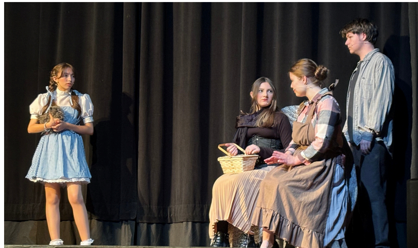
Miss Gulch confronting Dorothy and her family.