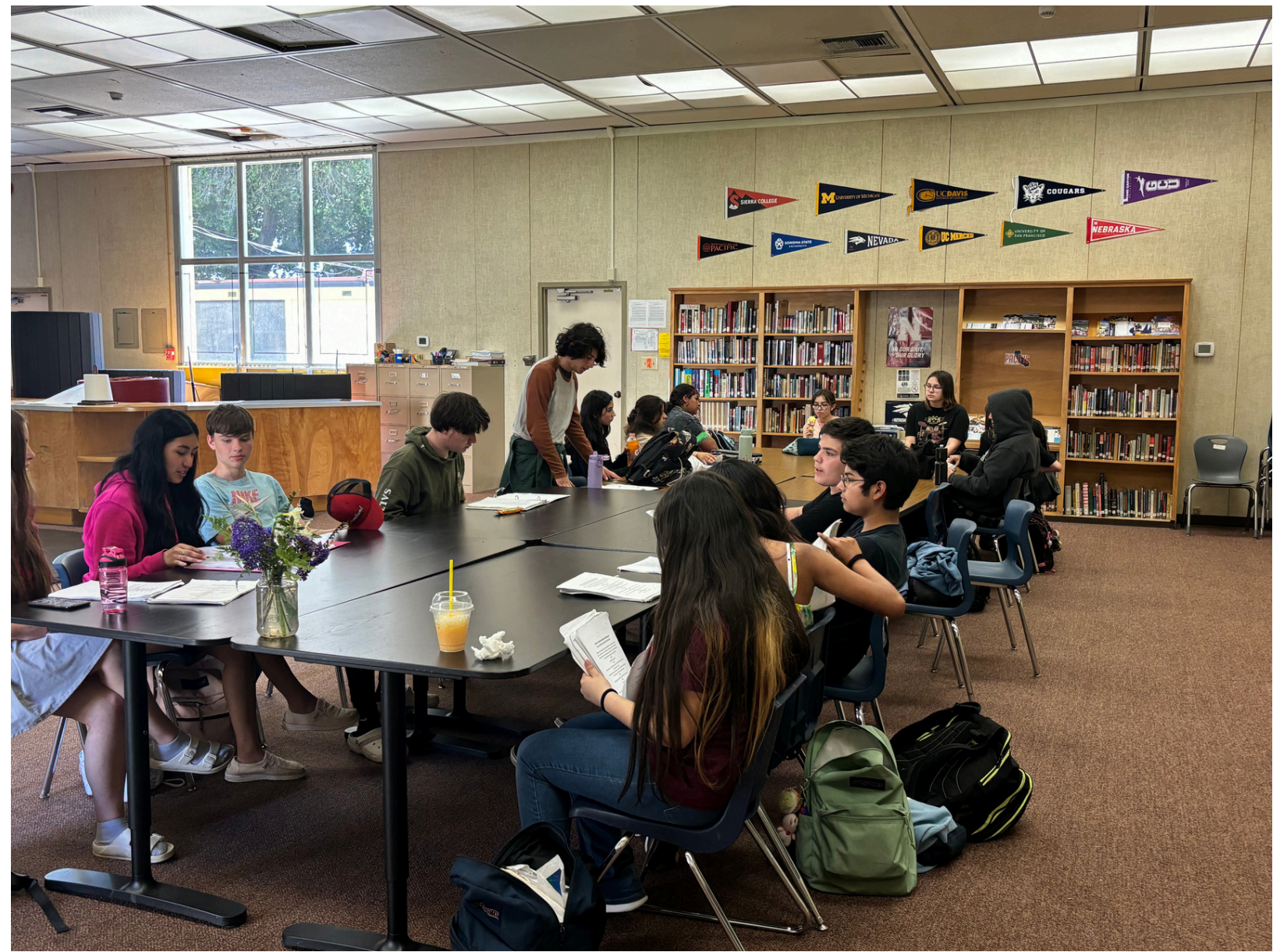
The cast reading through the scripts.