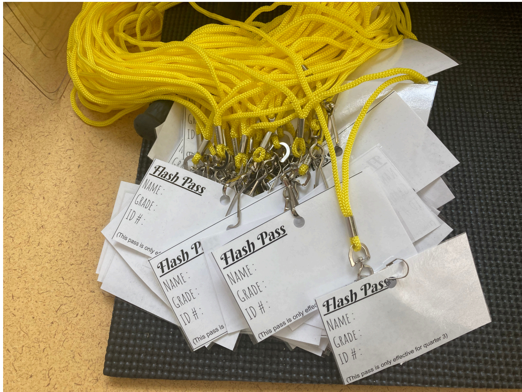
Physical copies of the Flash Passes - Copeland Ivener