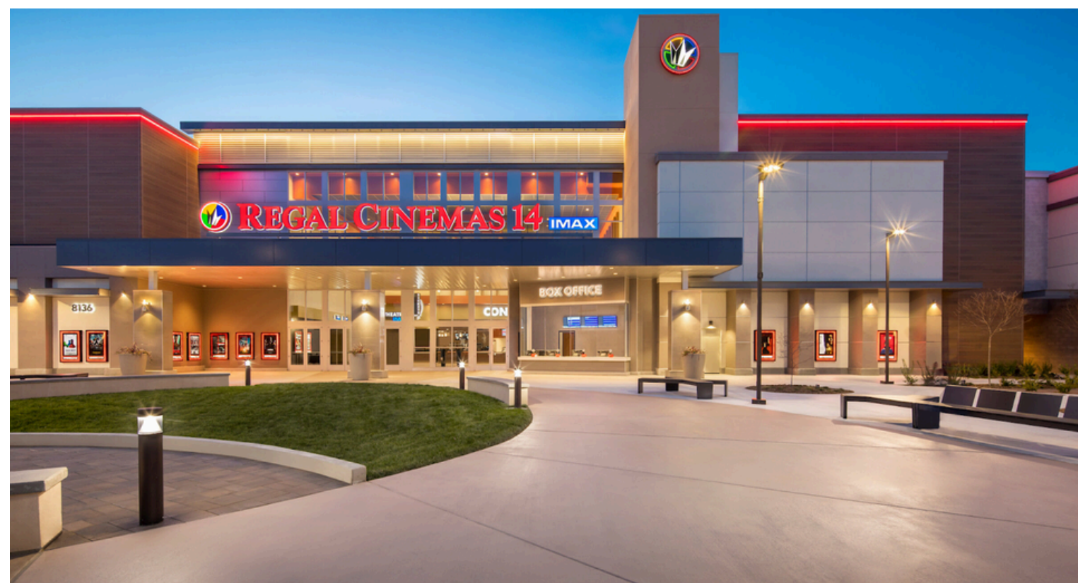
Delta Shores