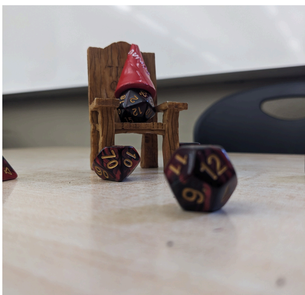
Dice used in D&D