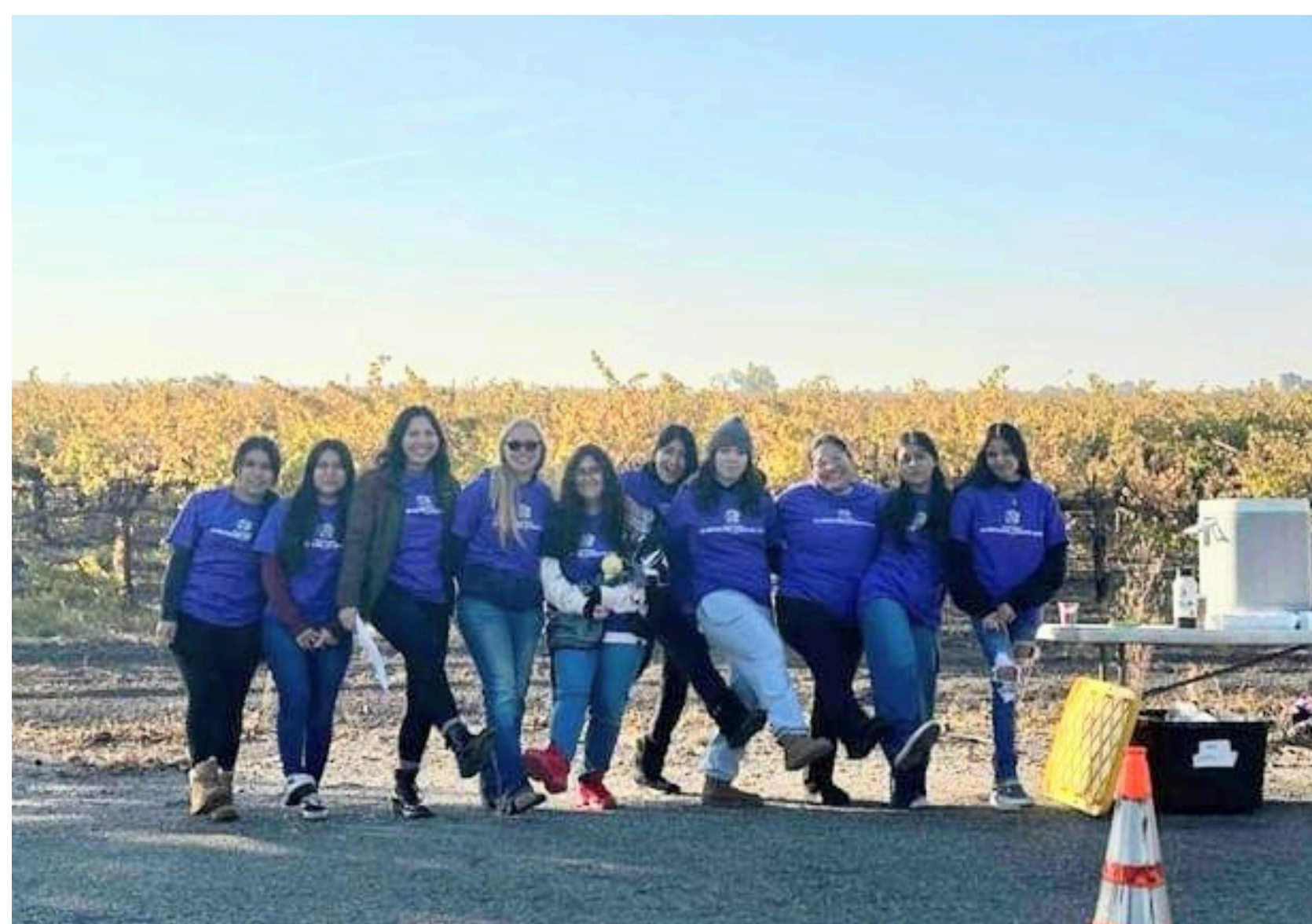
Latino Club volunteering at the Clarksburg Country Run - Country Run Volunteer