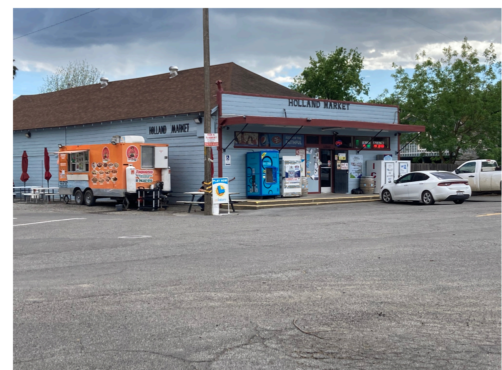
Holland Market and Tacos Doña Misa taco truck - Copeland Ivener

When it is a student’s turn to go, they will have to sign out with a smart pass for a 30 minute window and that’s all the time they’ll have. They are required to take with them a yellow lanyard with identification. If the student fails to return within the allotted time, they will no longer be allowed to participate in this program.