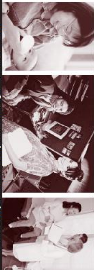
Department of Fair Employment and Housing

It is unlawful for an employer to discriminate in terms of compensation, conditions, or privileges of employment because of pregnancy.